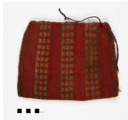
Title: Coca Leaf Bag (chuspa) Date: 1200-1450 Primary Maker: Chancay culture, Peru, Central Coast Medium: Wool