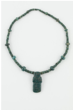
Title: Necklace with Axe-God Pendant Date: 100-500 Primary Maker: Chorotega culture Medium: Carved and polished greenstone