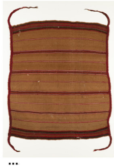
Title: Mantle Date: 1200-1450 Primary Maker: Chancay culture, Peru, Central Coast Medium: Cotton