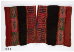
Title: Warp-Patterned Poncho Date: c.1500-1900 Primary Maker: Quechua Culture Medium: Camelid fiber