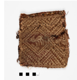
Title: Coca Leaf Bag (chuspa) Date: c. 1200 Primary Maker: Chancay culture, Peru, Central Coast Medium: Weaving