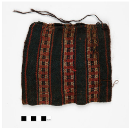
Title: Coca Leaf Bag (chuspa) Date: 1000-1476 Primary Maker: Chancay culture, Peru, Central Coast Medium: Woven camelid fiber