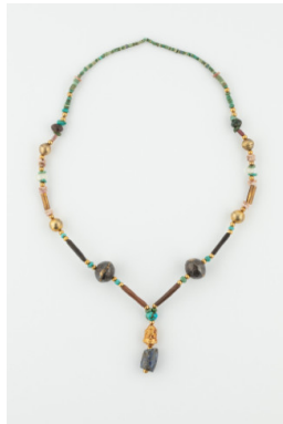
Title: Necklace with Gold Human Head Pendant Date: 1200-1350 Primary Maker: Chimu culture Medium: Gold, turquoise, carnelian, sodalite, quartz, shell