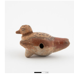
Title: Bird Effigy Whistle (ocarina) Date: c. 1200 - 1550 Primary Maker: Costa Rica, Nicoya zone, Guanacaste Medium: Ceramic