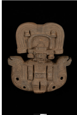
Title: Whistle with Bat-Masked Figure on Serpent Throne (ocarina) Date: 1100-1500 Primary Maker: Columbia, Sierra Nevada de Santa Marta, Tairona Medium: Unglazed ceramic