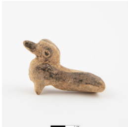
Title: Bird Effigy Whistle (ocarina) Primary Maker: Costa Rica, Rio de Jesus Medium: Clay with pigment