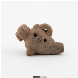
Title: Feline Effigy Whistle (ocarina) Date: 500-1000 Primary Maker: Costa Rica, Central Highlands Medium: Clay with incised lines