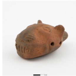
Title: Feline Effigy Head Whistle (ocarina) Date: 850-1522 Primary Maker: Costa Rican Medium: Clay with incised lines