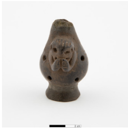
Title: Monkey Effigy Whistle (ocarina) Primary Maker: Costa Rican Medium: Burnished clay with incised lines