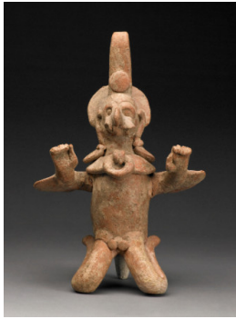
Title: Whistle of Man in Vulture Costume Date: 550 - 950 Primary Maker: Nahua culture Medium: Ceramic