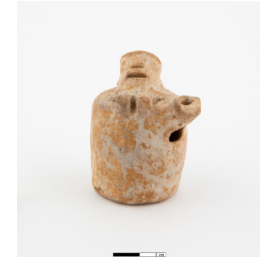
Title: Human Effigy Whistle (ocarina) Primary Maker: Costa Rican Medium: Clay with pigment