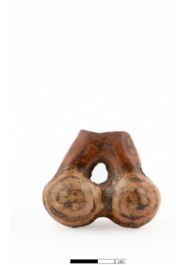
Title: Whistle (ocarina) Primary Maker: Panamanian Medium: Burnished clay with pigment