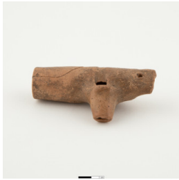
Title: Two Note Whistle Date: 1-200 Primary Maker: Costa Rican Medium: Ceramic