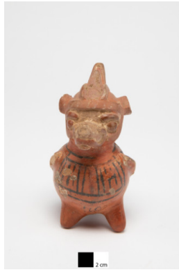
Title: Animal Effigy Whistle (ocarina) Date: 300-500 Primary Maker: Costa Rica, Nicoya zone, Guanacaste Medium: Clay with pigment