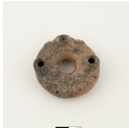
Title: Wreath Whistle (ocarina) Primary Maker: Costa Rica, Rio de Jesus Medium: Clay