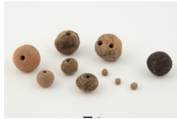
Title: Spindle Whorls, Whistle (ocarina) and Rattle Pellets Date: 300-800 Primary Maker: Costa Rica, Nicoya Zone Medium: Ceramic