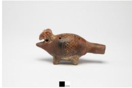
Title: Parrot Effigy Whistle (ocarina) Primary Maker: Costa Rican Medium: Parrot of burnished clay with pigments.