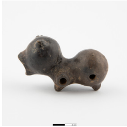
Title: Feline Effigy Whistle (ocarina) Date: 1-500 Primary Maker: Costa Rica, Central Highlands Medium: Clay with pigment