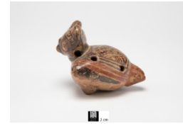
Title: Bat Effigy Whistle (ocarina) Date: c. 1200-1550 Primary Maker: Costa Rica, Nicoya zone, Guanacaste Medium: Burnished clay with pigments