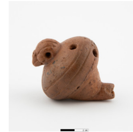
Title: Bird Effigy Whistle (ocarina) Date: 300 BCE - 300 CE Primary Maker: Costa Rica, Nicoya zone, Guanacaste Medium: Clay with pigment