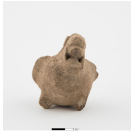
Title: Bird Effigy Rattle Date: n.d. Primary Maker: Costa Rica, Diquis Medium: Ceramic