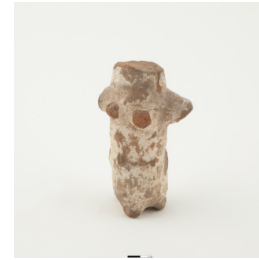
Title: Rattle Date: n.d. Primary Maker: Costa Rican Medium: Ceramic with white slip