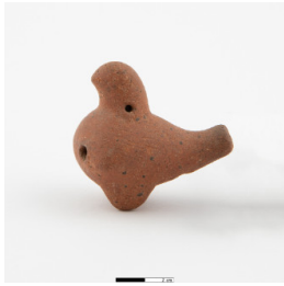
Title: Bird Effigy Whistle (ocarina) Primary Maker: Costa Rican Medium: Clay