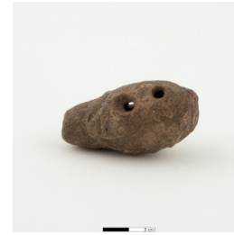
Title: Four Note Whistle (ocarina) Date: 1200-1550 Primary Maker: Costa Rican, Atlantic Watershed Medium: Ceramic