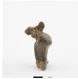
Title: Frog Effigy Whistle (ocarina) Primary Maker: Panamanian Medium: Clay