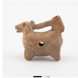
Title: Animal Effigy Whistle (ocarina) Primary Maker: Costa Rican Medium: Clay pigment